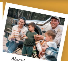
North of the Murray!