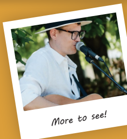
More to see!